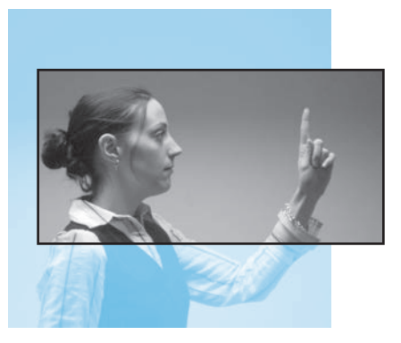
Carrying out exercise 5, shake/stare.