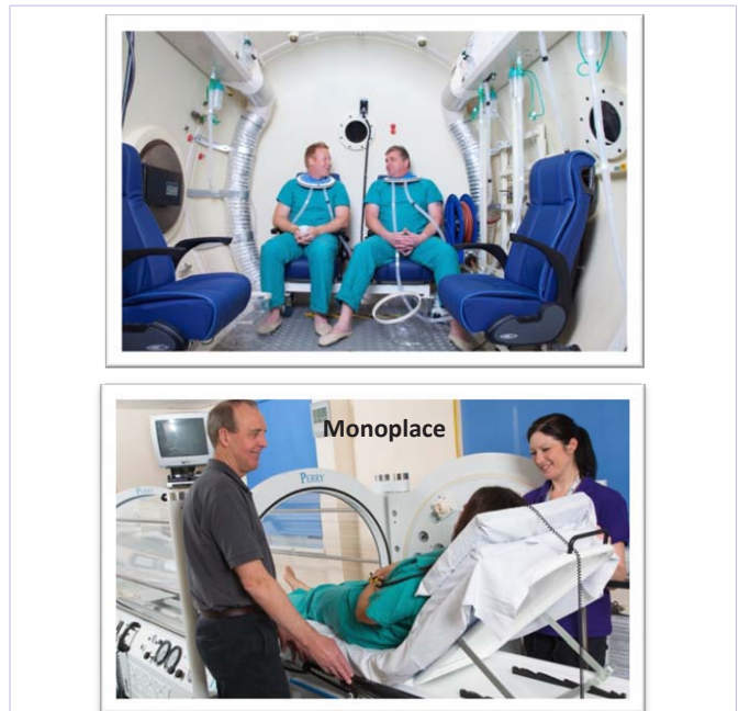
Figure 2: Multiplace and Monoplace Chambers.