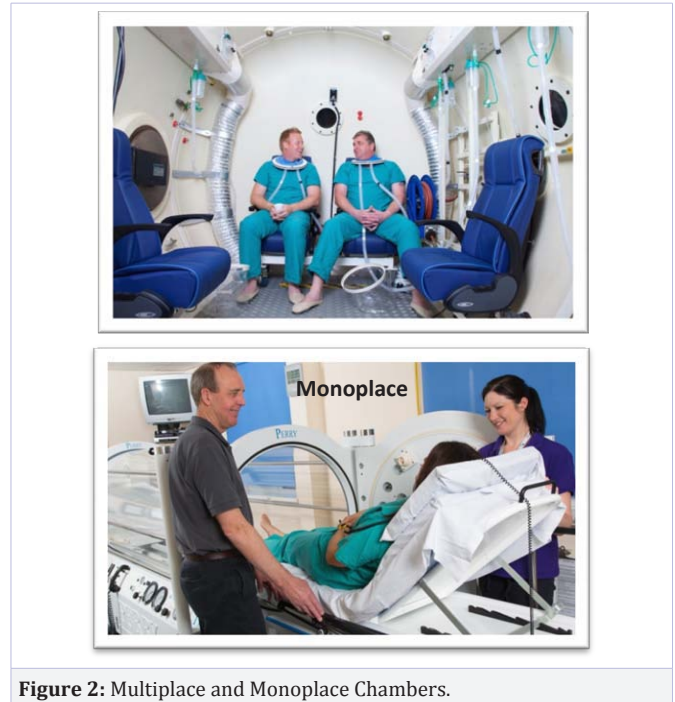
Figure 2: Multiplace and Monoplace Chambers.