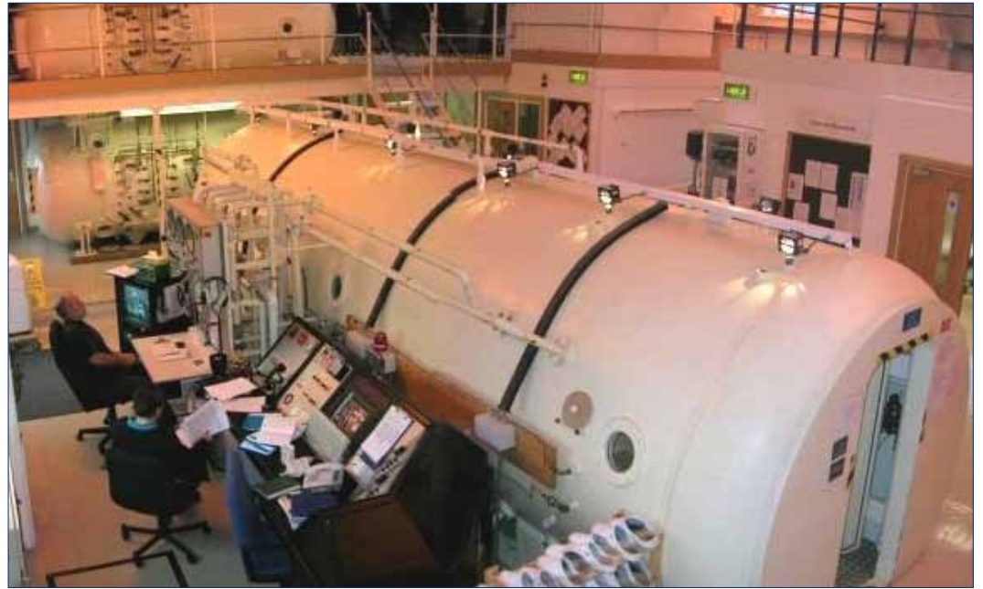
Figure 1. View of a hyperbaric oxygen therapy chamber.