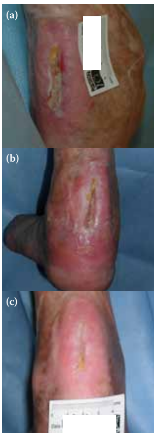
Figure 2. (a) Patient A's wound at presentation to the Diving Diseases Research Centre (DDRC) with 90% slough; (b) after 40 hyperbaric oxygen (HBO) treatments with 30% slough; (c) and at 1-year follow-up with 90% epithelialisation.

Four months after completion of HBO, healing had continued and 90% epithelialisation (Figure 3c) had been achieved. Patient B was happy with the outcome.