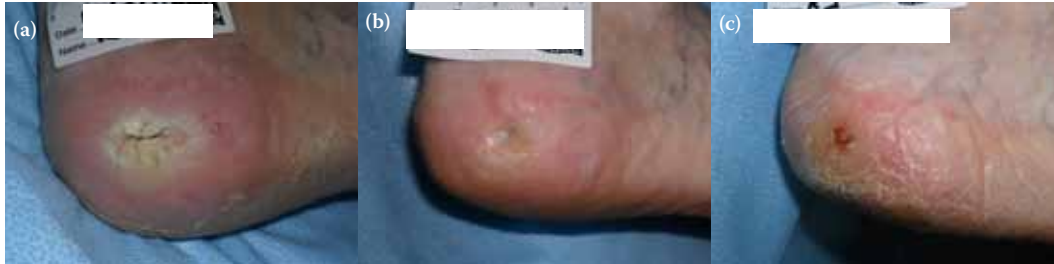
Figure 3. (a) Patient B's wound at presentation to the Diving Diseases Research Centre. (b) The wound's depth reduced from 1.2 cm to 0.3 cm after 40 episodes of hyperbaric oxygen therapy (HBO). (c) The wound 4 months after completion of the course of HBO showing 90% epithelialisation.

than acute wounds, even when not showing clear signs of infection (Edwards and Harding, 2004). Therefore, the increased oxygenation of the wound during HBO may allow the patient's immune system to more effectively combat infection. For example, Patient B's recurrent infections ceased during HBO, suggesting a change in his ability to fight infection.