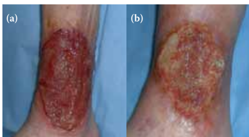
Figures 4. (a) Patient C's left lateral ulcer shown at presentation of the Diving Diseases Research Centre; (b) and after 60 hyperbaric oxygen therapy treatment.

“These cases suggest that HBO can be beneficial for chronic wounds with no obvious hypoxic component. However, the use of HBO as an adjunct therapy in wound care should be carefully considered and outcomes closely monitored.”